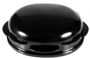
Preferred Earcups (outer shell)