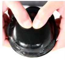
SPH-4B Only Earcup (outer shell)