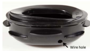
Mil-Spec Earcups (outer shell)

4. Another difference between the two earcups is the location of the wire hole. The preferred earcup wirehole is drilled below the junction of the center and top tab on the outer shell vice the center of the middle tab on the outer shell for the obsolete earcup.