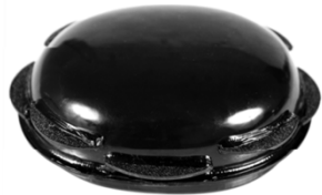
SPH-4B Only Earcups (outer shell)

1. If the eight retention fitting tabs on the earcup are glued to the earcup, then it's not the preferred earcup. The preferred earcup shells are injection molded as one part.