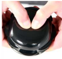
Preferred Earcup (outer shell)

3. Hold the earcup with both hands so your thumbs are on the inner lip that goes over your ear and press down. If the lip barely flexes and feels rigid, it's not the preferred earcup. The inner lip on the preferred earcups are fairly flexible.