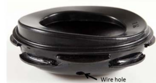
Obsolete Earcups (outer shell)

So what's the big deal about using outdated or noncompliant equipment? The chart below tells the story: