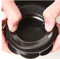
Preferred Earcup (Inner lip)