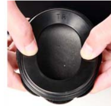
SPH-4B Only Earcup (Inner Lip)

4. Another difference between the two earcups is the location of the wire hole. The preferred earcup wirehole is drilled below the junction of the center and top tab on the outer shell vice the center of the middle tab on the outer shell for the obsolete earcup.